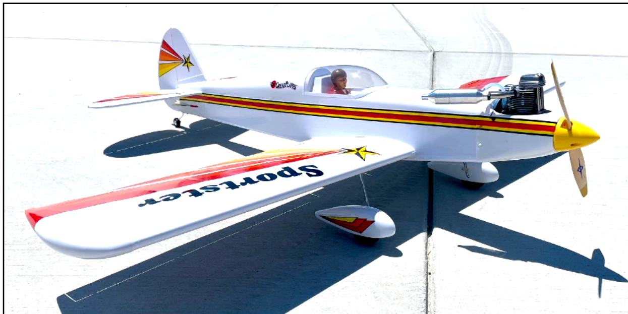
Great Planes Super Sportster 40 ARF assembled by the Editor. O.S. .70 Surpass for power, Futaba radio system. Maiden soon!