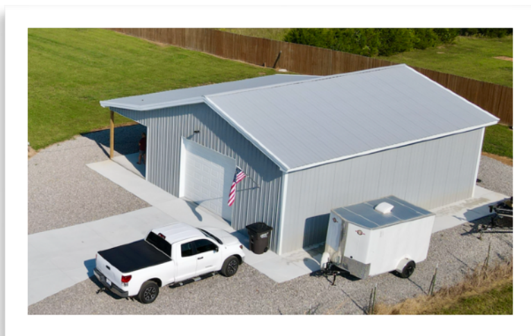
The brand new RC Hangar in Tennessee!